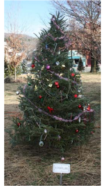
Stop by the David A. Howe Library and see all of the beautiful Christmas trees including this one decorated by the Voice group! Great job to all the members of Voice!

The Friends of Allegany Arc Foundation wishes everyone a holiday season filled with happiness and prosperity.